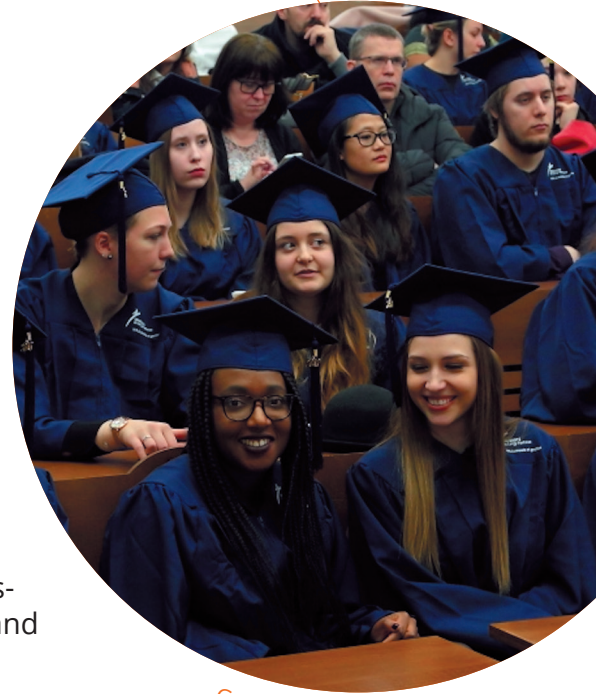
Graduation ceremony CY Cergy Paris Université

Fundamentally, Ecotopia graduates will be trained to embed sustainability in their projects and responses to challenges throughout their careers and lives as engaged citizens of the world.