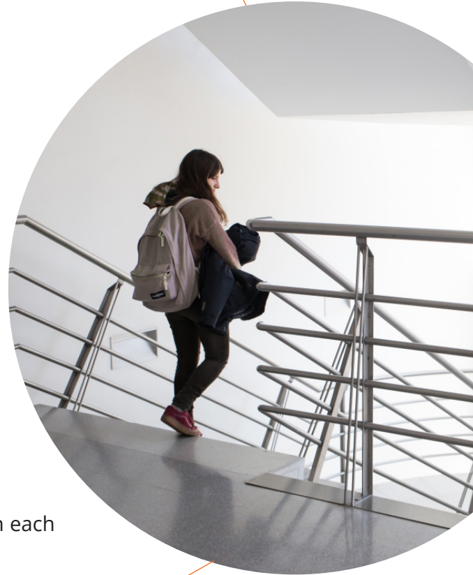
ESCI - UPF - Barcelona

The programme will involve 5 to 15 students in each partner institution.